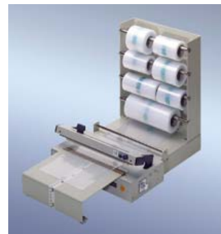
230 FSV with magazine + table

www.polystar-hamburg.de eMail: info@polystar-hamburg.de