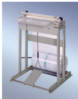
420 FSV with floor stand