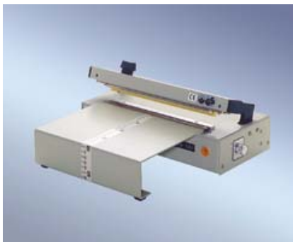
230 FSV with table